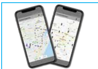
Supervisor application improves management.