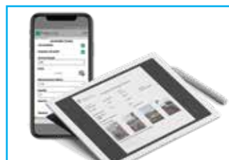
Digital transformation with PDF output.