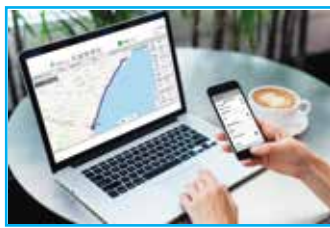
The 'Breadcrumb' trail views shows speed direction, location and status of workers.