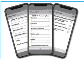
Covid-19 Self-Assessment Forms and Surveys