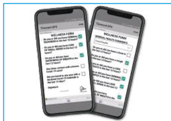
Custom Digital Forms to transform paper processes