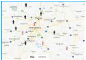
View individual worker details including activity and current positions.

The mobile data captured helps employers manage their workforce better by increasing efficiency, productivity, reducing time-theft, and streamline the back-office payroll processes.